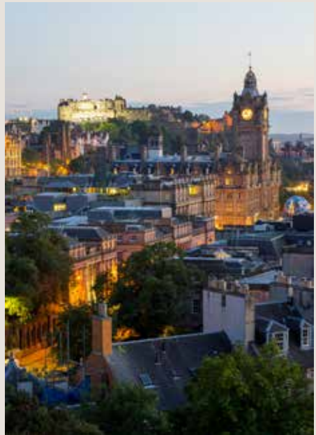
The centre of Edinburgh from Carlton Hill

With a population of just under 500,000 in 2011, Edinburgh is Scotland's second largest city after Glasgow.