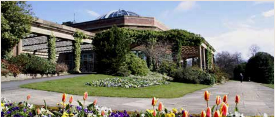
Pavilion at Valley Gardens

Explore Harrogate's spa history at the Royal Pump Room Museum, check out its Royal and famous visitors and see the sulphur wells.