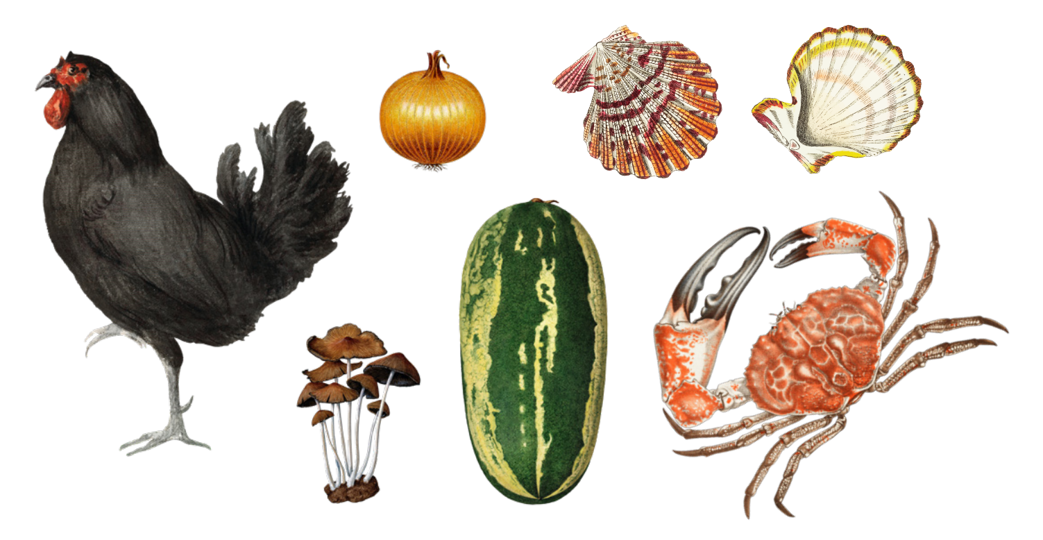
♦ Supplement Applies Hotel residents on a dinner inclusive package can choose 2 or 3 courses (dependent on package) from Hors D'oeuvres and/or Patisseries et Desserts and Plats Principaux. Supplements apply to some dishes, as indicated.

For special dietary requirements or allergy information, please speak with a member of our team before ordering. To prioritise your safety, we're unable to modify dishes for allergens. However, a full allergen matrix is available. Although we endeavour to do so, we cannot guarantee that any of our dishes are allergen free or fulfil dietary requirements due to possible cross contamination during production. [VGI] = Does not include any ingredients derived from animals. [VGIA] = Alternative available that does not include any ingredients derived from animals. [V] = Vegetarian. Cheese boards may contain unpasteurised cheese. Calorie content. Calculations as accurate as possible however slight variations may occur. To maintain a healthy weight, the daily recommended intake of calories for adults is around 2,000 calories a day. All of our prices include VAT. A discretionary service charge of 12.5% will be added to your bill.